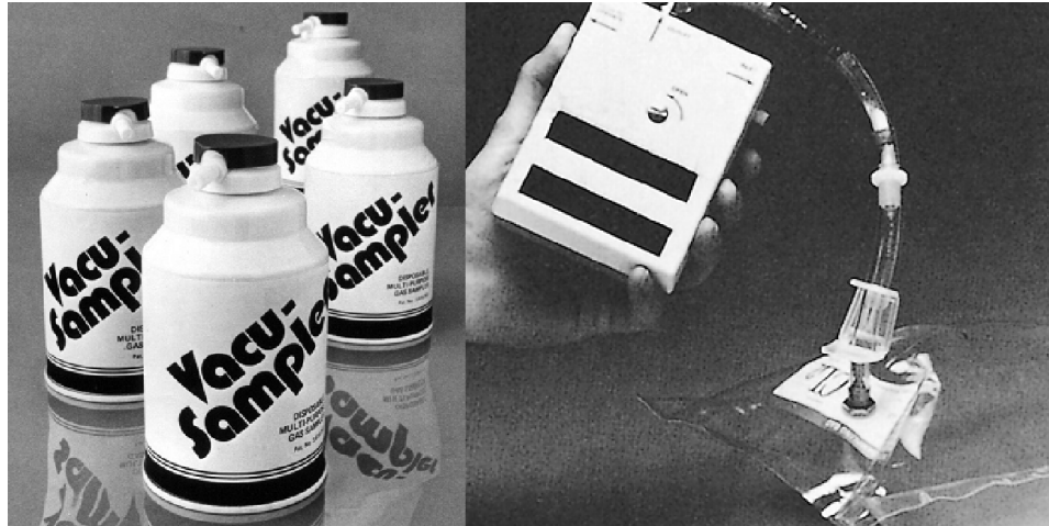
Fig. (2): An evacuated container is used to collect air for analysis.